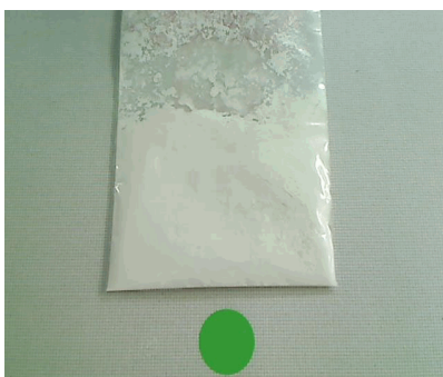
View of content (1mm x 1mm scale)