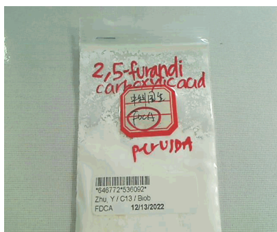
Package received - labeling COC

Laboratory Number Beta-646772 Percent modern carbon (pMC) 99.90 +/- 0.29 pMC Atmospheric adjustment factor (REF) 100.0; = pMC/1.000